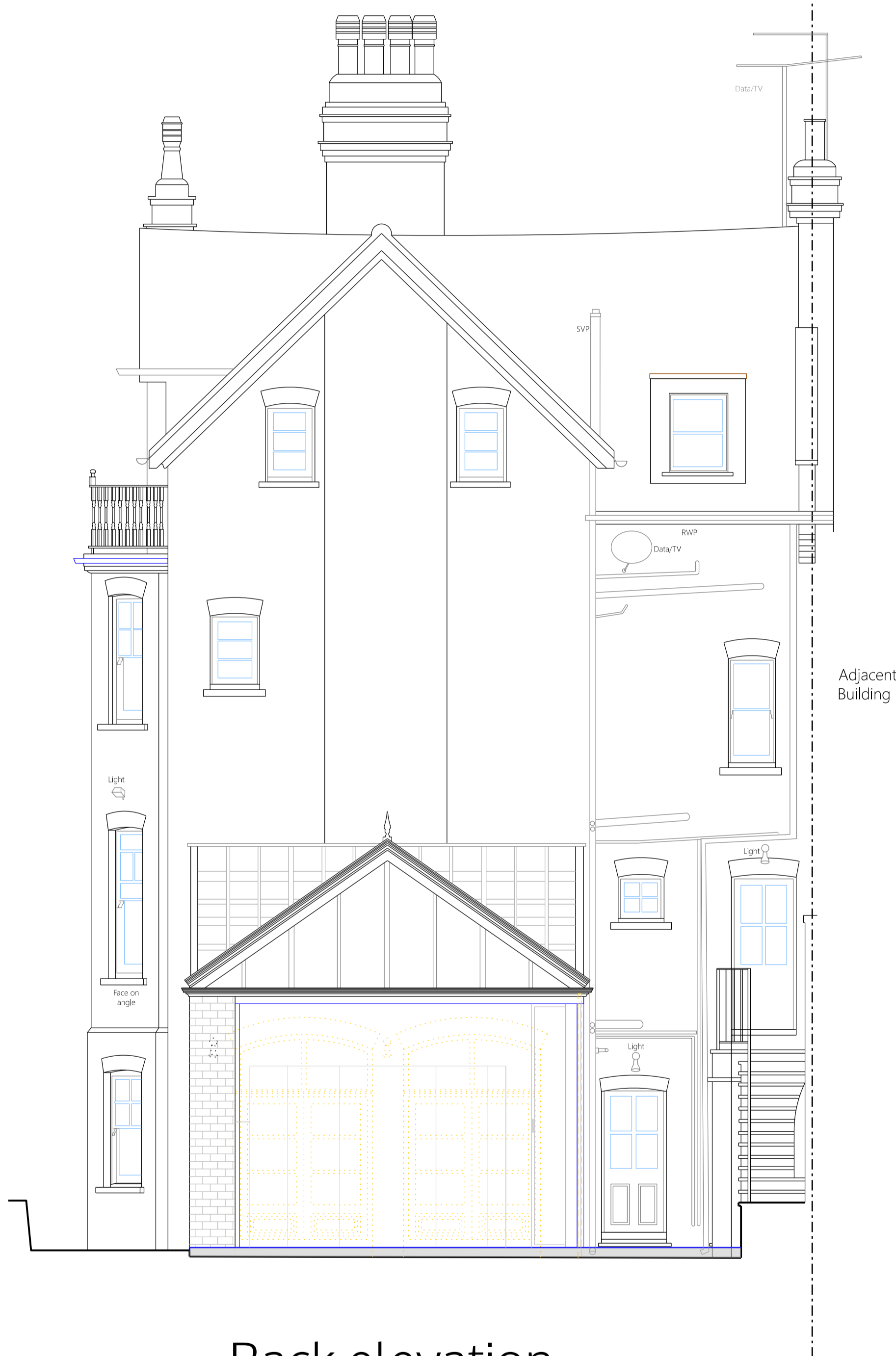
Back elevation (open)

+14.00 m +13.00 m +12.00 m +11.00 m +10.00 m +9.00 m +8.00 m +7.00 m +6.00 m +5.00 m +4.00 m +3.00 m +2.00 m +1.00 m +0.00 m